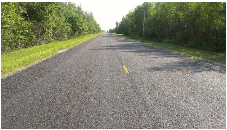
Figure 2 - TH 89 after placement of chip seal

Ride quality data has been collected on two different micro mill and chip seal projects for this investigation. The data is outlined in the table and chart below. From the data, it appears there is an improvement in MRI over the first two to four years. By the third or fourth year following treatment, the MRI appears to return to approximately the same value as before the treatment. This means that for a relatively small cost, the ride quality of a pavement can be improved for two to four years by micro-milling and chip sealing.