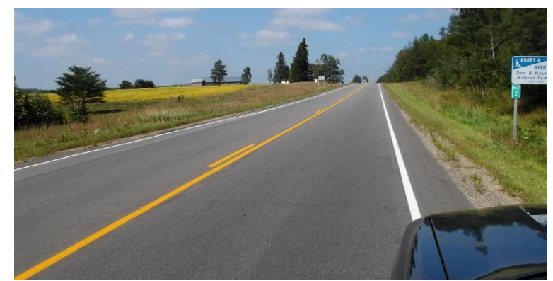
Figure 4 - TH 64 after 1 year

Three micro mill with micro surfacing projects and their respective MRI data have been analyzed for this investigation. From this data, there appears to be a significant improvement to ride quality on two of the three projects when compared to the original surface. More data will need to be collected to determine the longevity of the improvements in ride quality. It should be noted that, while the section on US 12 had an initial ride improvement lasting about four years, it then returned to and exceeded its pre-treatment MRI values in the subsequent years. The micro mill and micro surfacing on US 12 was placed on a bituminous overlay over concrete pavement.