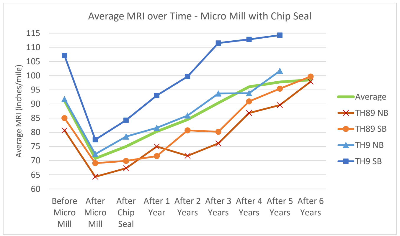
Figure 3 – Micro mill with chip seal performance chart