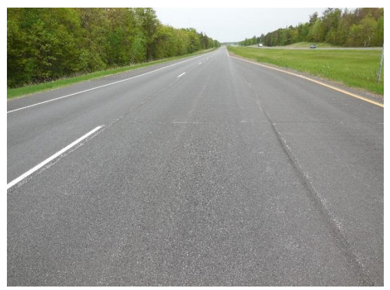
Figure 6 – US 10 After 1 Year

As with micro surfacing, more ride data will need to be collected in subsequent years since the sections in this report have not yet returned to their pre-treatment MRI values. Additional ride quality data will provide further insight into the effectiveness of micro milling with UTBWC at improving ride and preserving pavement condition, but current results are very promising.